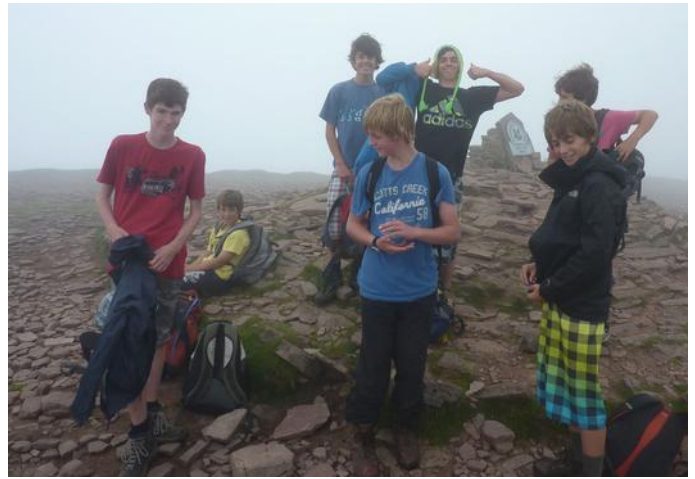
Above: Pen y Fan. Apparently the other group had a view when they got to this point.

option. Hard was an understatement to say the least, as we found out about 10 mins into the day! The “easy” group canoed down the Brecon canal, and then cycled back along the tow-path. The hard group split in 2 and swapped at lunchtime. They did a 21km cross country cycle over some hills and through villages and then did a hike up massive hills, some of which consisted of scrambling up and one of them was Pen-y-Fan. Although we all complained about the required effort, when reaching the top of the hills the view was most definitely worth it. We slept really well that night!