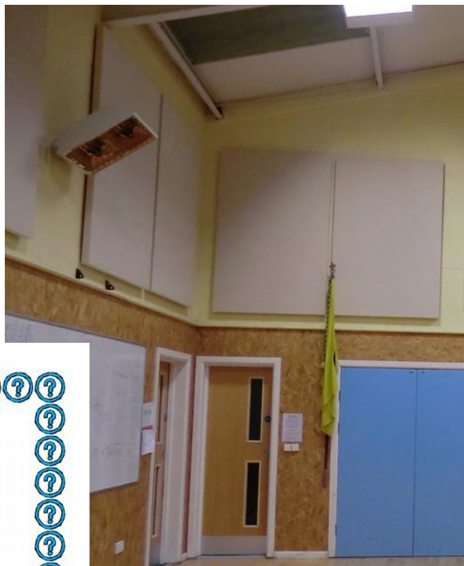
Above: New acoustic panels in the H.Q.

Not knowing how difficult the job would be we organised work parties for the first weekend of 2012, allowing for three days graft and many hands to be available. By mid Friday afternoon it was clear to us that it was going to be easier to do than first