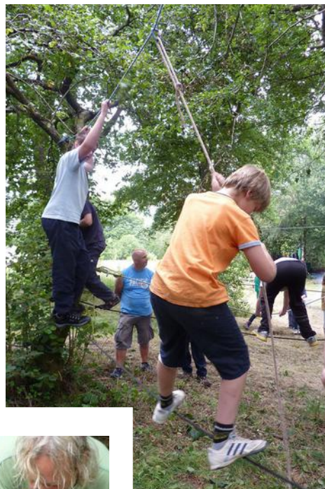
Far Below: Climbing at Three Cliffs