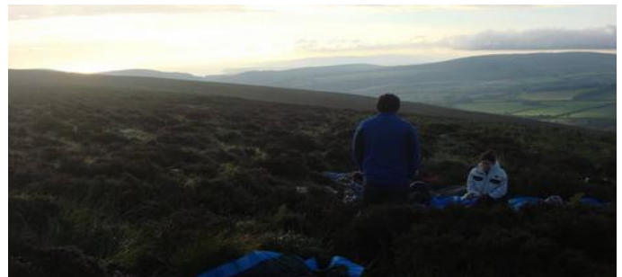
Below: waking up on Dunkery Beacon