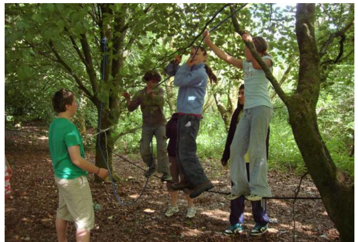
Above: On the low ropes course

Rafting consisted of two teams, roughly made up of Scouts in one and Explorers in the other. The Scout raft floated beautifully and they paddled it across the lake at speed. The Explorer raft (shall we say a lightweight design) had failed spectacularly leaving the Explorers in the water amongst pieces of