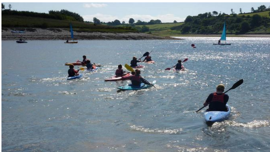
Below left: water activities on the reservoir