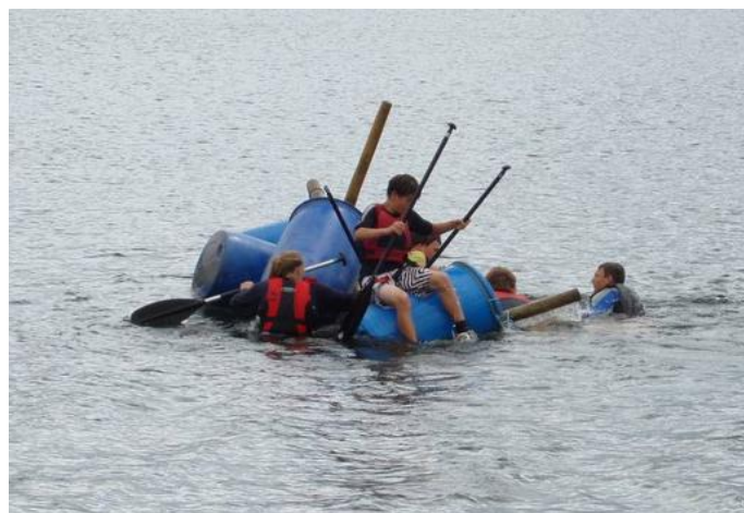
Above: The Explorer raft