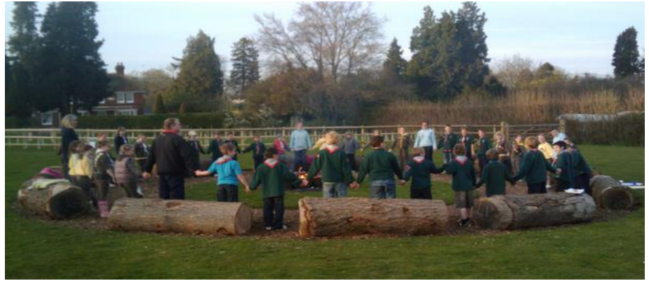
Above: Cubs & Brownies using the camp-fire circle built last year using funding from ACRE

One of the most used additions to the groups assets in 2010 was the camp-fire circle at the Scout Centre. Even, without a fire cubs naturally gather around it. However they have enjoyed it throughout the year as it was intended. We have cooked 'Smores' (2 chocolate digestives with a melted marshmallow squeezed between - once you've had one you want 'smore') almost every time a fire has been lit! On Guy Fawkes night we shot our flaming ballistae (each six made a mini pioneered ballister firing a meths fuelled bamboo cane javelin - yes a risk assessment was done!) from around the circle. Many sausages were sizzled and songs were sung particularly with our guests, the Alderholt Brownies, earlier in the year (see photo). The cubs are again looking forward to enjoying the magic created around our camp-fire circle throughout 2011.