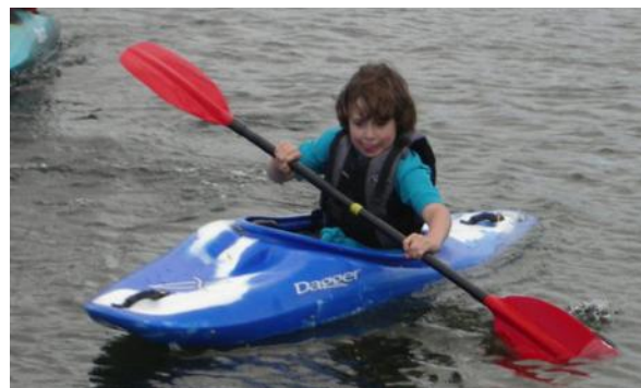
Above: Beavers enjoying water activities at Spinnaker, June last year