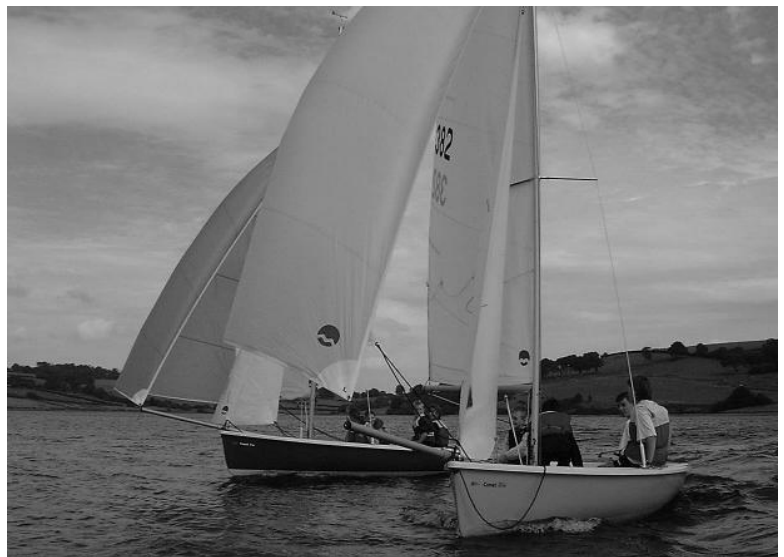
Sailing at Wimbleball

The day was spent sailing and canoeing at Wimbleball. We had the use of two Comet Trios which gave the scouts the opportunity to learn to use a gennaker. We stayed at Wimbleball for a barbecue in evening.