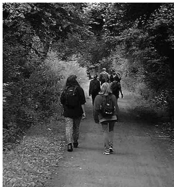
Below: The Tarka Trail